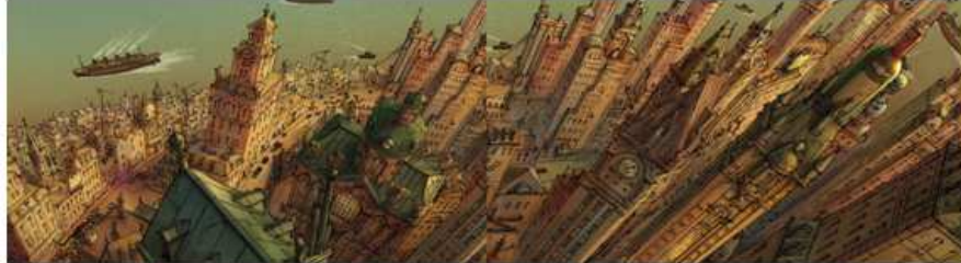
Figure 3: Top View of Belleville

shown as being swallowed up by the city. In the film, extensive visual references and details exist which connect the audience to the film. A slowing down of the action, almost to freeze frame, in the scene where a bottle of water is handed to Champion by a fan, is quite remarkable.