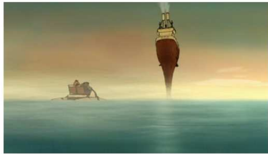
Figure 1: Arrival in Belleville