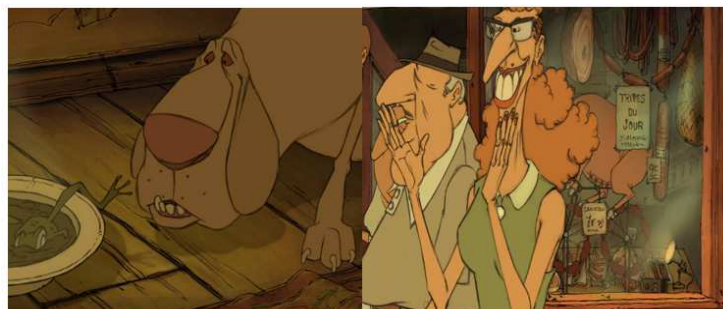
Figure 4: The Search Line in Characters

New Wavers who intend to give the audience a constant feeling of watching a movie, do not correct mistakes made in shooting the film. According to them, cinema is intertwined with real errors. In those years, a microphone appearing on screen is not seen as a mistake, and is a bond established with the audience to show the film as it is. Similar features are found in French animated films. In ‘The Triplets of Belleville’, the search line drawn characters are seen and some are left as a rough draft (Figure 4). In this way, audiences are drawn into a world of film construction and are made to feel part of the production.