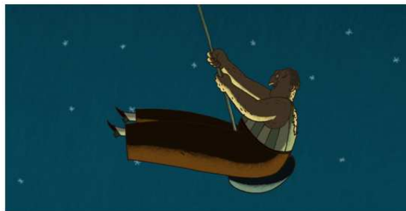
Figure 7: Texture of Paper and Traces of Paint

The direct bond between the audience and film producer, which is an important feature of French New Wave is seen in the film 'A Cat in Paris'. The film is produced completely by hand-drawings with vibrating lines due to the lines not coinciding exactly. Perfect and single lines do not exist in this movie as audiences are accustomed with Disney films. Occasionally, the texture of paper on which backgrounds are drawn, is seen and the hand-painted traces of pencils and paints are evident (Figure 7).