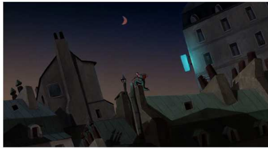
Figure 6: Long Chase Scenes