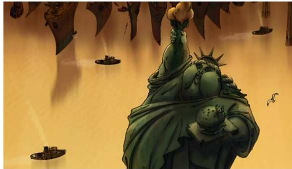
Figure 2: The Statue of Liberty in Belleville

innocent look, defeats mafia although she is a stranger in the city.